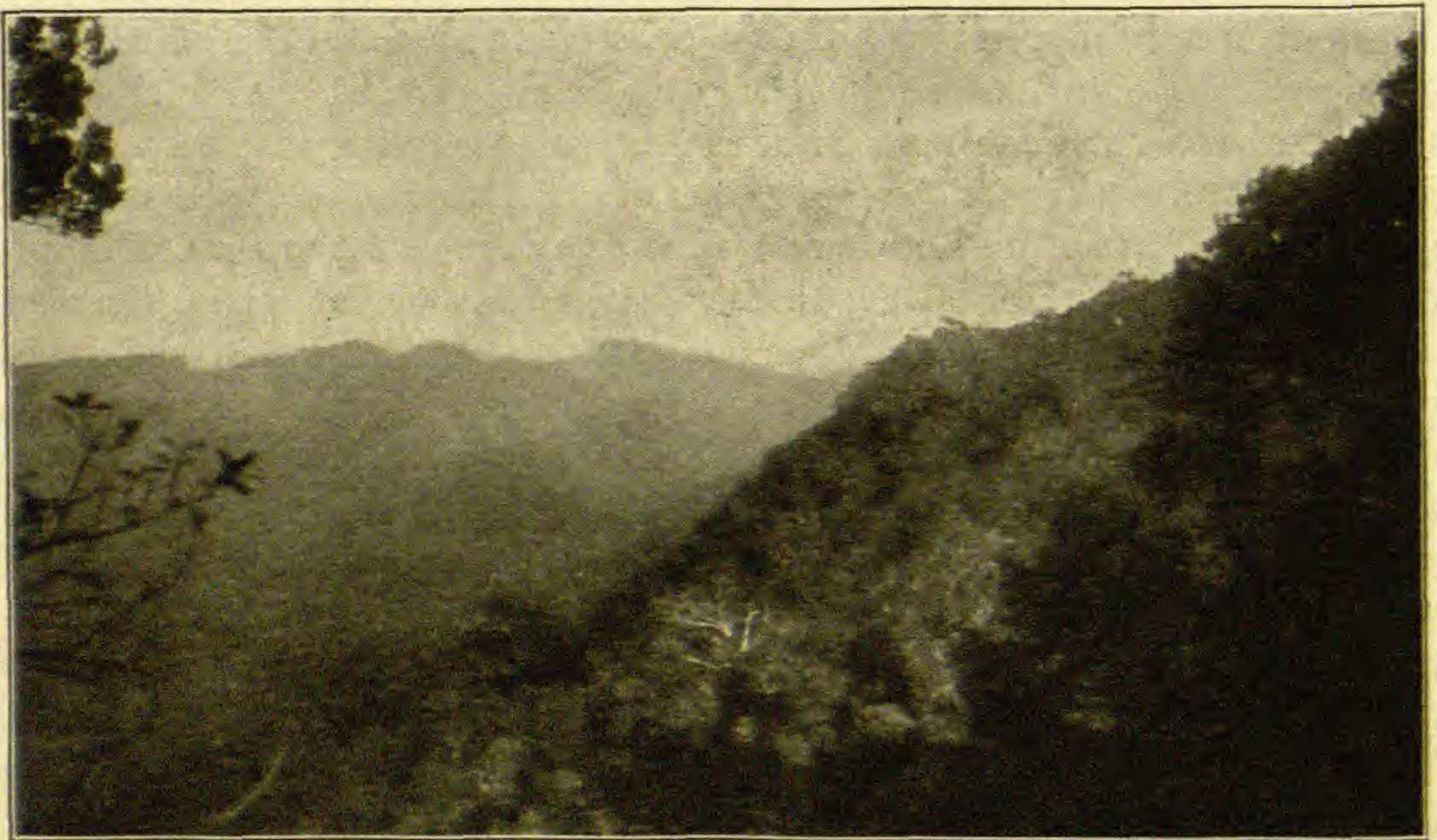
FIG. 2.—View from a dividing ridge between 2 long humid valleys, looking toward the head of Kau-kona-hua Valley; fog-covered summit ridge, elevation 2500 ft., seen in distance; entire region covered with dense and unbroken rain forest; on slopes and ridges trees average 15–30 ft. in height, in valley and ravines they rise to 40–60 ft.; annual precipitation at head of this valley approximates 200–300 inches.

3. Forest zone.—(a) Lower forest (1000–2000 ft.), with humid and arid sections; in early times this zone extended much farther seaward on the various islands than it does now; (b) middle forest